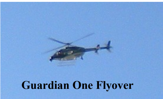
Guardian One Flyover