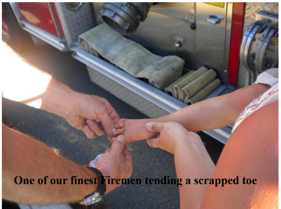
One of our finest Firemen tending a scrapped toe