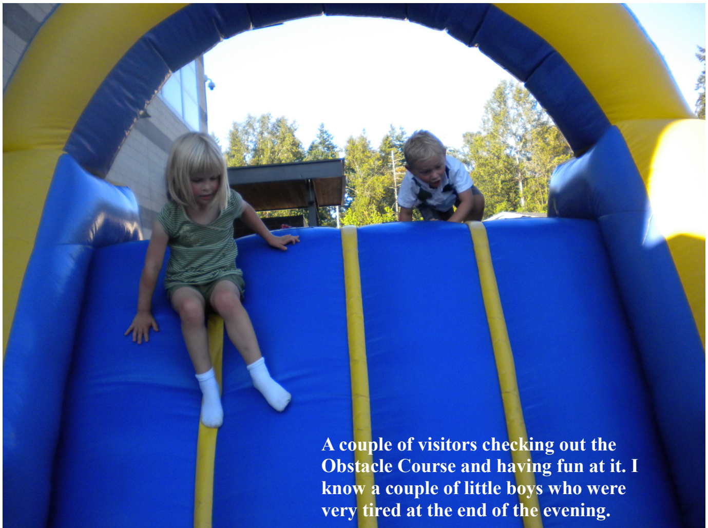
A couple of visitors checking out the Obstacle Course and having fun at it. I know a couple of little boys who were very tired at the end of the evening.