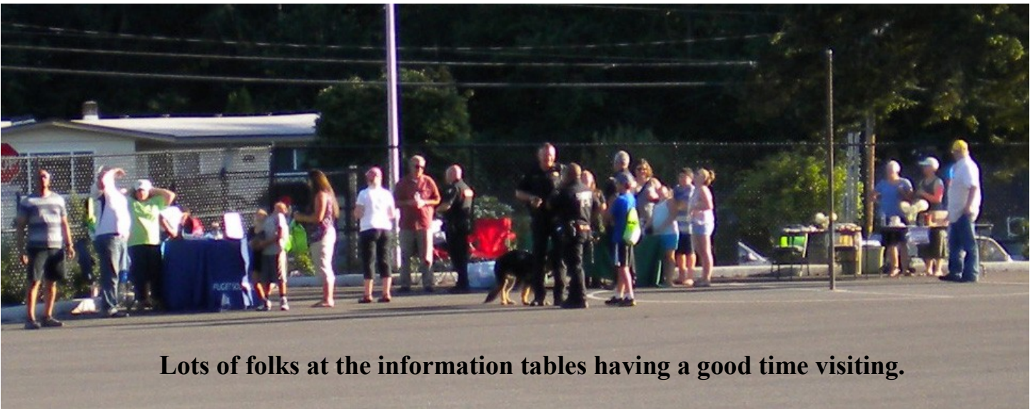
Lots of folks at the information tables having a good time visiting.

Finally here are some lessons learned from this years event. Number one is to have multiple event layout plans in the event of rain or really hot conditions. We planned our layout for normal weather with a contingency for rain, but not for hot weather. During the event several of our groups had to move to cooler shadier locations to escape the heat. Also it was agreed that we had ourselves to spread out on the location. This at times made it difficult to watch kids and talk at different information tables. Unfortunately we also did not have a good enough communication with the School district on our needs which resulted in us not having access to the school rest rooms, which we ask and paid for. As it turned out, that didn't become a problem. One other note to pass on for NNO events is this. Resources are at a premium among all of the organizations holding events on this date, which makes it harder for small organizations like ours to draw resources to our events. Organizers should take a hard look at the merits of having community safety / resource events on another day in order to have greater opportunities available. That is not to say that we didn't appreciate all the folks and organizations that participated at this event. We truly enjoyed having everyone there and hope that we can make these type of events happen again in the future.