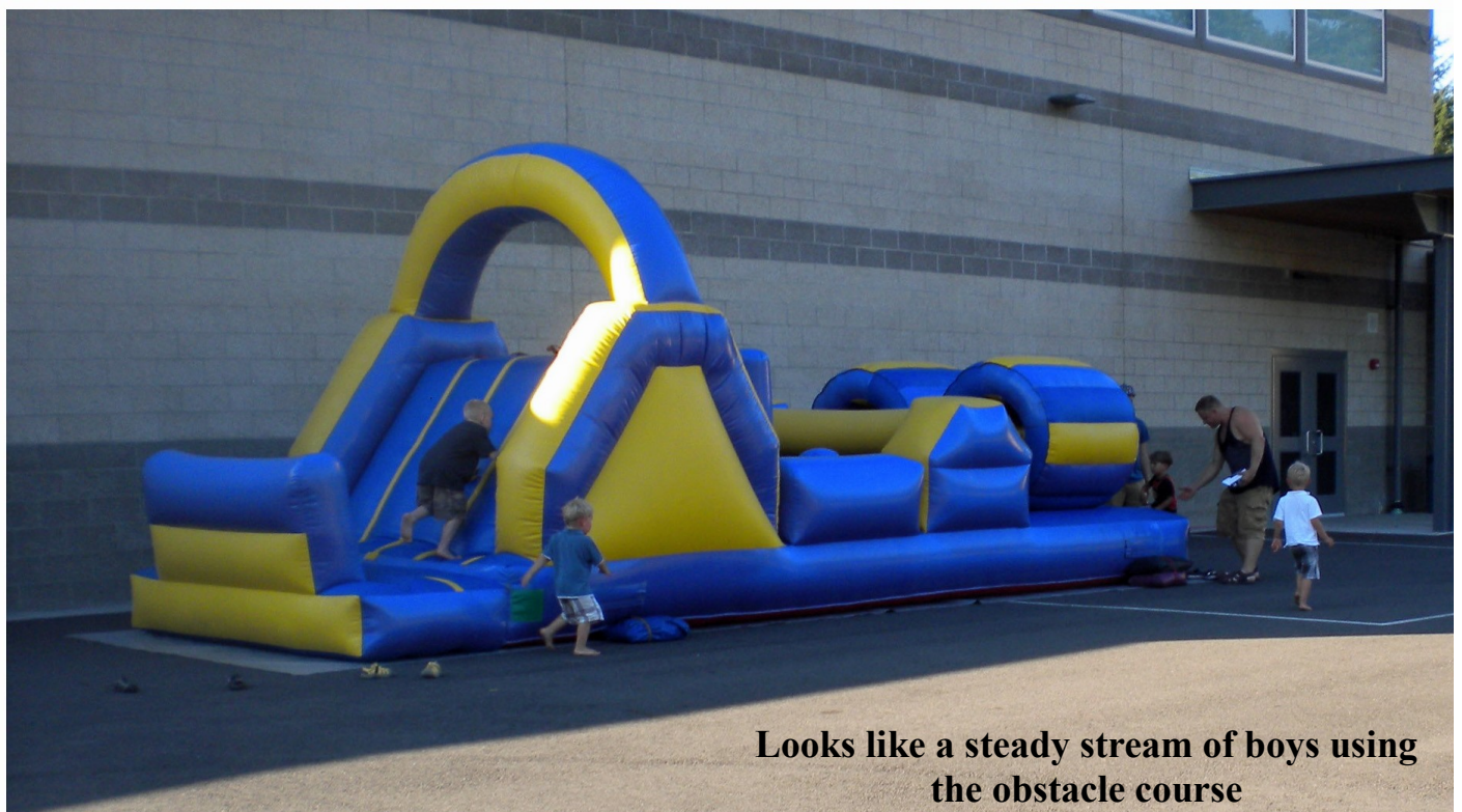
Looks like a steady stream of boys using the obstacle course

National Night Out is founded and supported by the National Association of Town Watch (NATW), a Non-profit organization dedicated to the development and promotion of various crime prevention programs including neighborhood watch groups, law enforcement agencies, state and regional crime prevention associations, businesses, civic groups, and individuals devoted to building safer communities. The nation's premiere crime prevention network works with law enforcement officials and civilian leaders to keep crime watch volunteers informed, interested, involved and motivated. Since 1981, NATW continues to serve thousands of members across the nation.