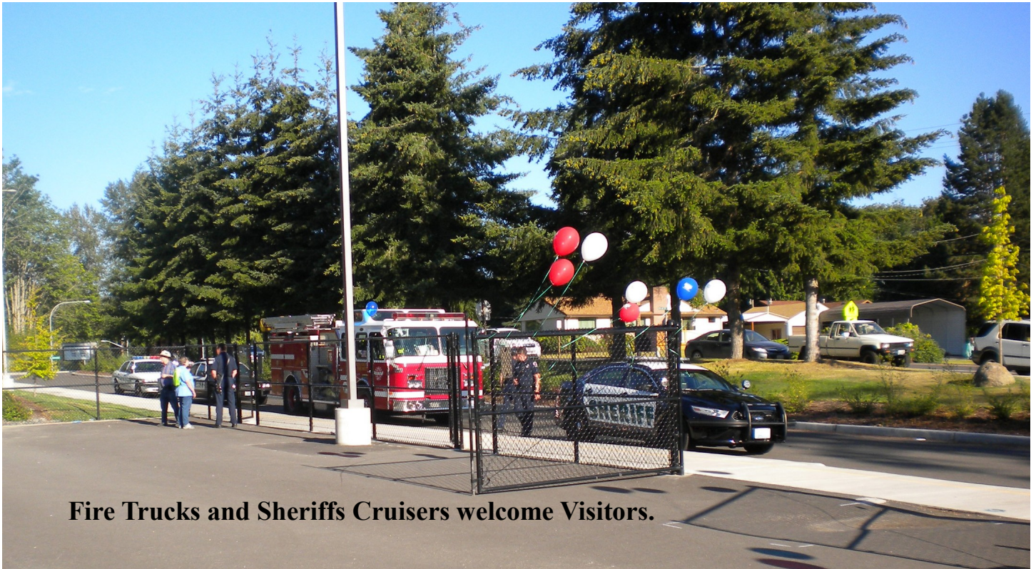
Fire Trucks and Sheriffs Cruisers welcome Visitors.