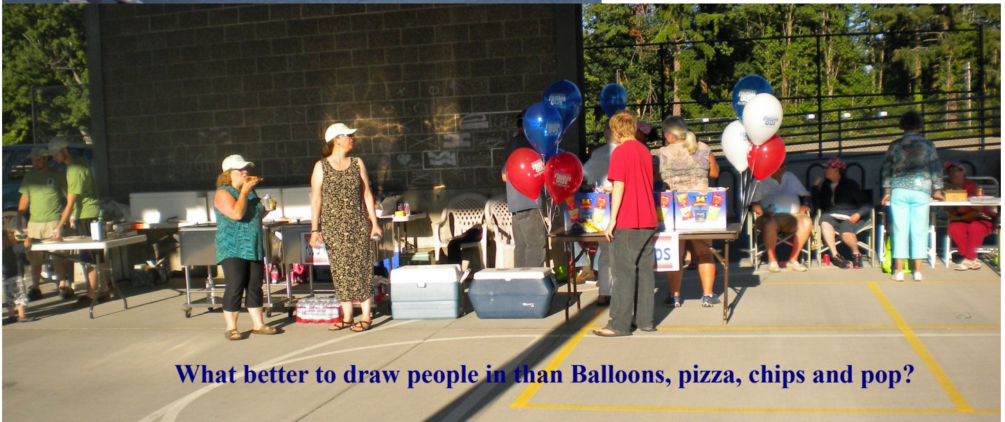
What better to draw people in than Balloons, pizza, chips and pop?